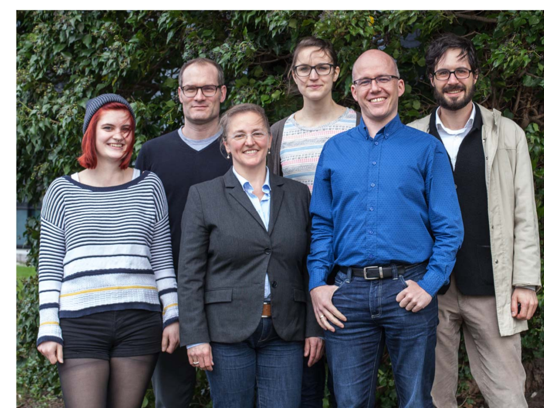
AP GOVERNANCE Free University Berlin | University Vechta